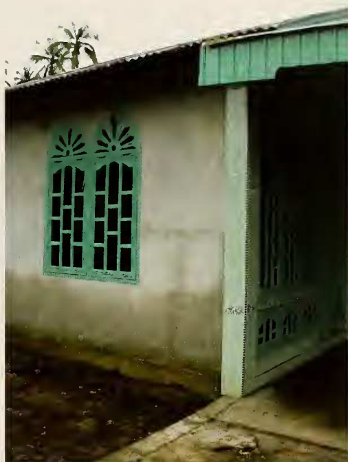
Figure 5. Water mark on house on Pulau Baleh; mark represents the daily height of water inundation at high tide. This house is approximately 70 m inland.

The survey conducted at the headland adjacent to ‘Ug Batukapal’ indicated a very different type of reef community. Here the reef was composed of large flat solid plates of limestone ‘coral pavement’ (50% of total transect) interspersed with soft corals; specifically of the genus Sinularia and whip corals (Fig. 6a and b). There were few hard corals (hard coral cover was only 6%) compared to the number of soft corals present, which accounted for 27% of the total substrate along the transect line.